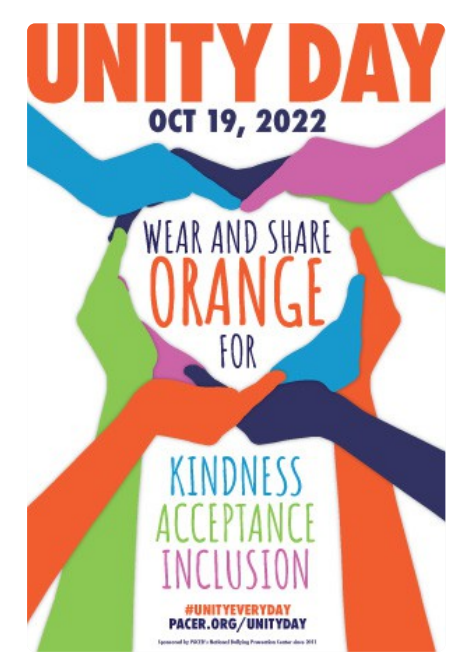
Unity Day Wednesday, October 19 WEAR ORANGE!